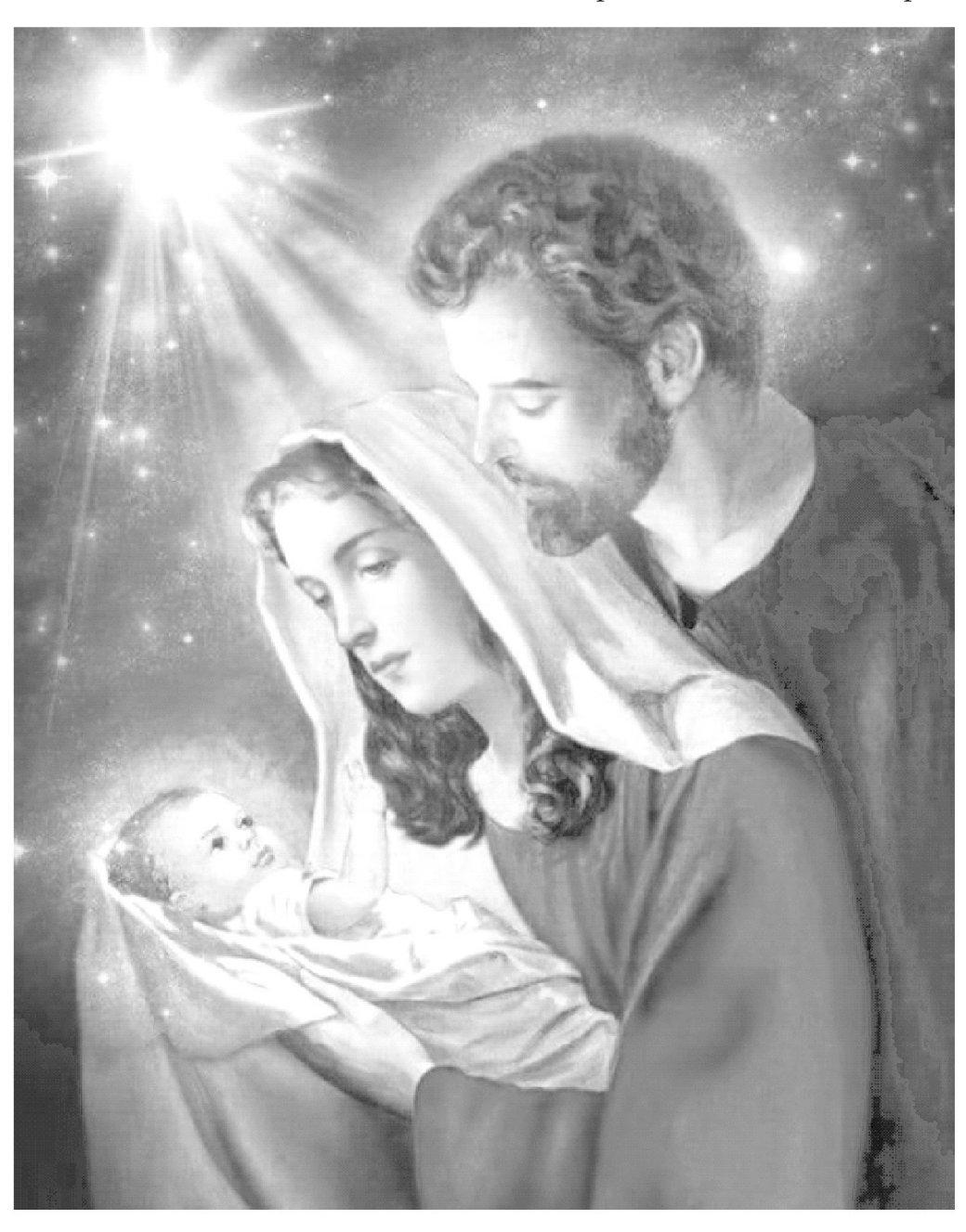
Feast of the Holy Family

Office Hours: Tues. & Wed. 9:30 am - 12:30 pm, Fri. 9:30 am - 12:30 pm